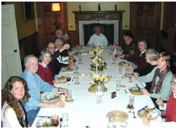
← One of our three grand dinners.

All you Gargunnochians are back home safe and sound, we presume. And we trust you had a good time in Scotland. Here are some photos to remind you of our week-long gathering.