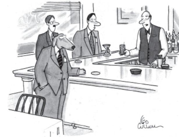
"Scotch and toilet water?"