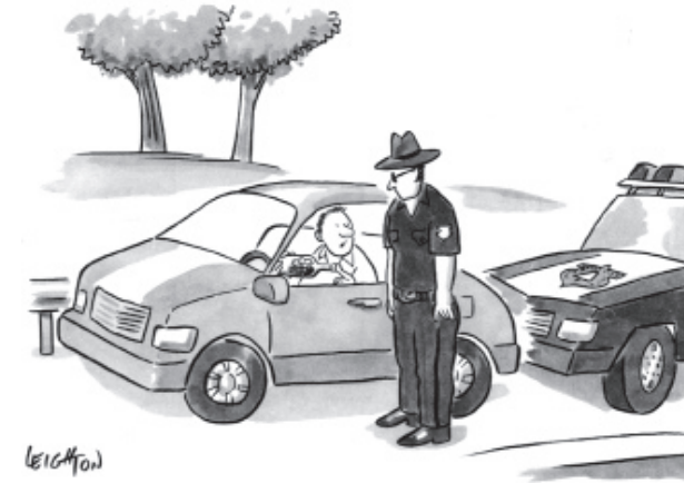
"I wasn't texting. I was building this ship in a bottle."