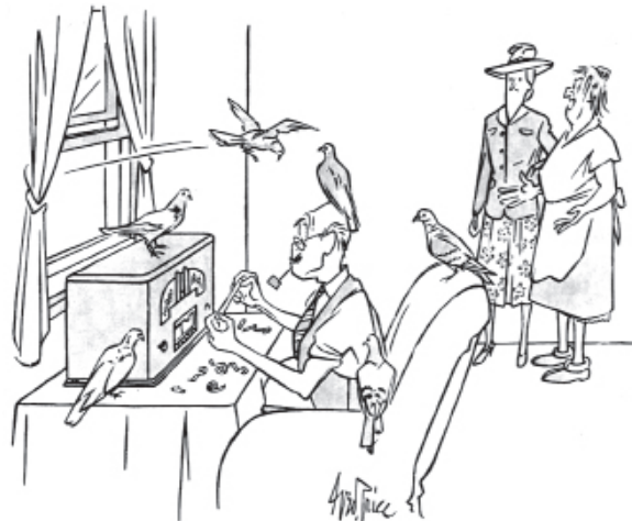
"It's the Times bulletins every hour on the hour, the Daily News bulletins every hour on the half-hour, and those damn carrier pigeons in between."