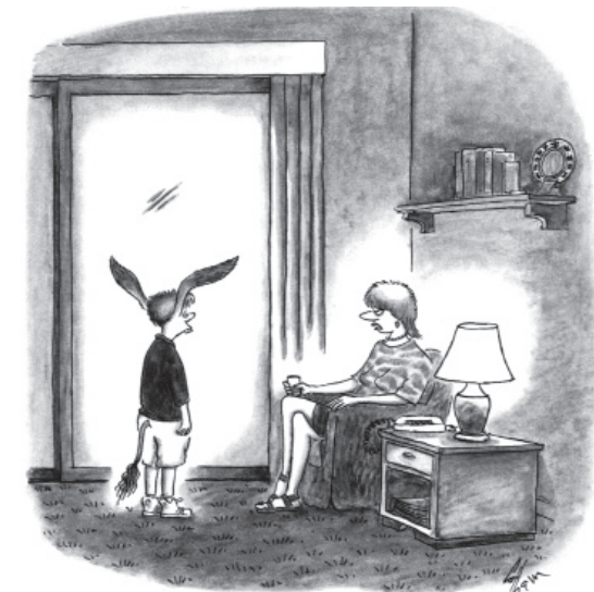
"Your father was a jackass."