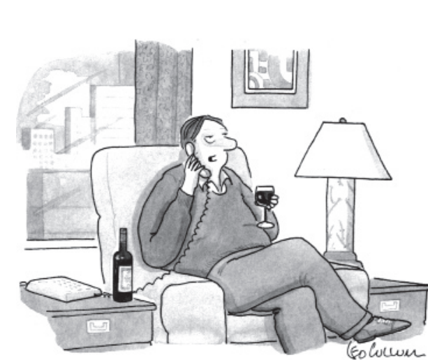
"Not much—just flushing out my arteries."