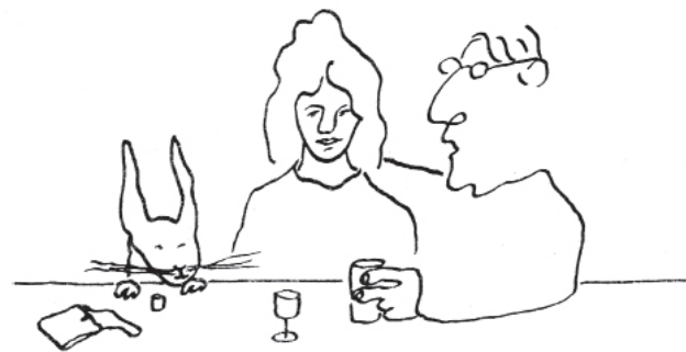
"I said, 'your hare looks lovely tonight!'"