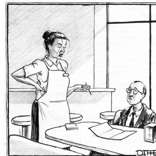
"Sorry, we don't serve the Lumberjack Breakfast to accountants."