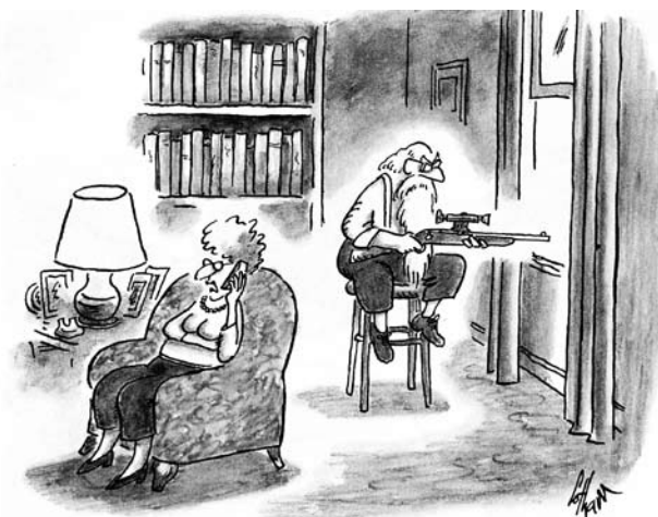
"He's angry about getting old."