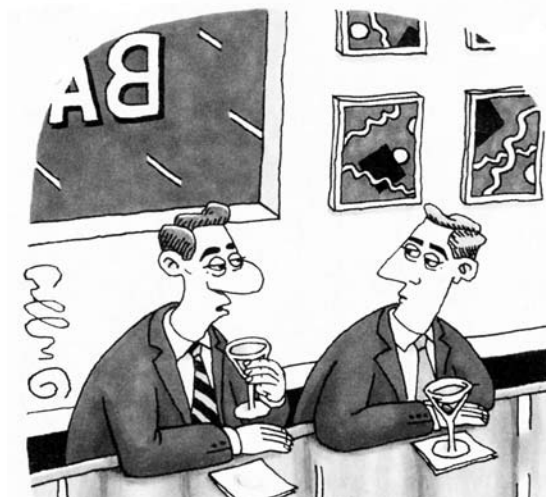
"I figure if I don't have that third Martini, then the terrorists win."