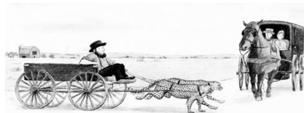
"Amish Midlife Crisis.."