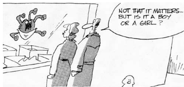
"Not that it matters...but is it a boy or a girl."