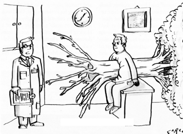
"Actually, this is one condition your insurance does cover."