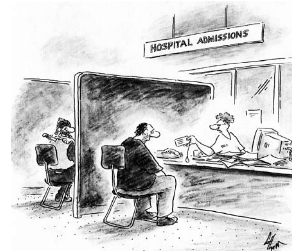
"Fill out the tag and attach it to your big toe."