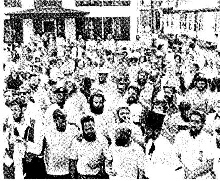
Brothers of the Brush

The following people donated countless hours of unselfish dedication for the success of Jaffrey's Bicentennial: