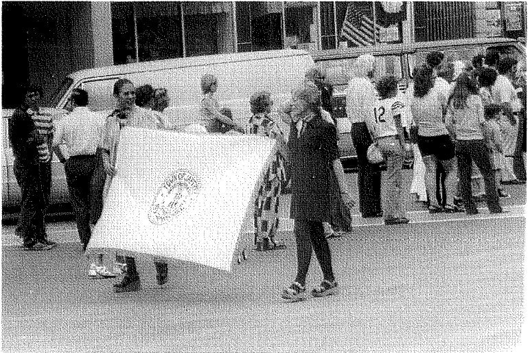
Jaffrey Bicentennial flag